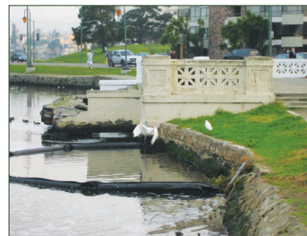
18th street pier before