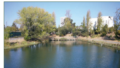
Existing 10th street culverts