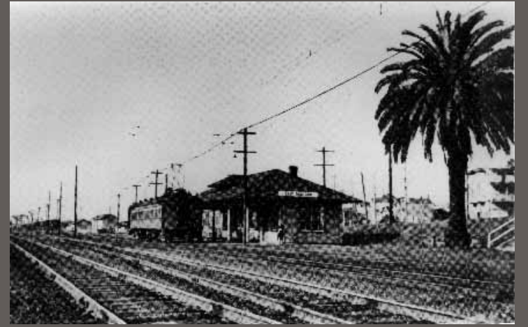
East Oakland Station, about 1910

Following the arrival of the railroad in 1869, the shoreline of Brooklyn Basin became an industrial district. By World War I, lumber yards, boat yards, and factories lined the shore. The railroad tracks were built on filled land bordering the original shoreline bluffs. The palm tree marks the site of Southern Pacific's East Oakland station (shown above). The building has been moved to old Embarcadero Cove, a half mile east of here.