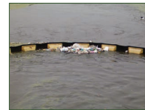
Trash from storm drains