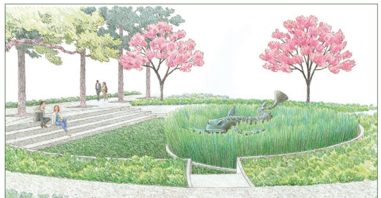
Planned Makkewekes rain garden sculpture by WOWHAUS

Project is scheduled to begin construction in 2015