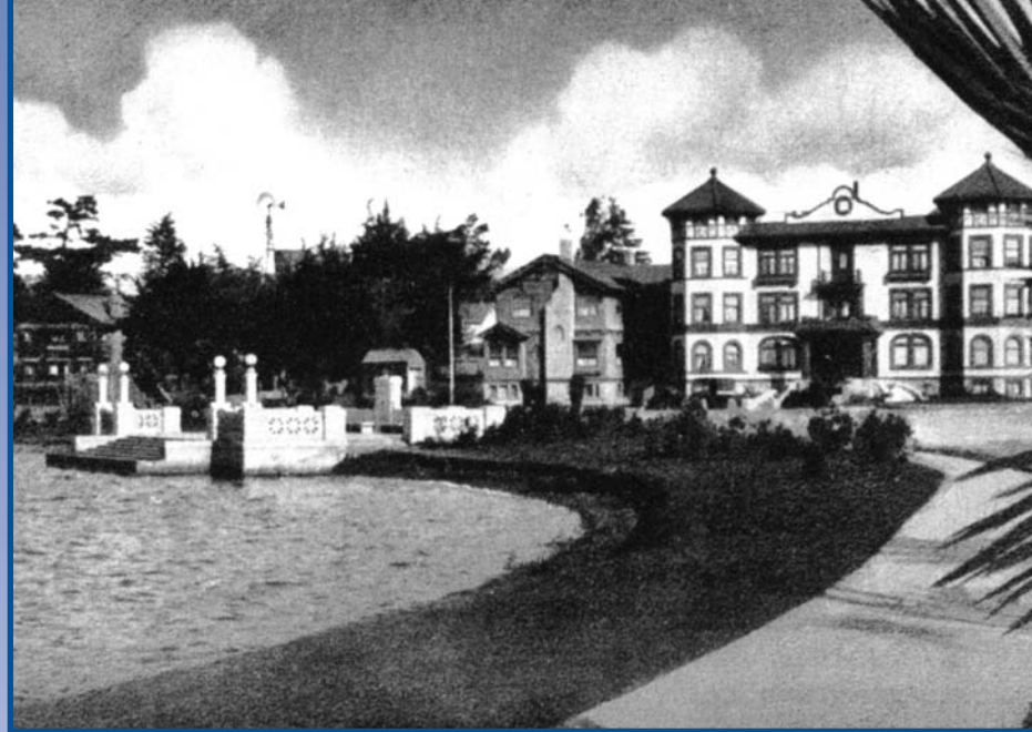
Historic Postcard showing stairs and lights to be replaced

Architectural Drawing showing Reconstructed Pier view from north side of pier looking south